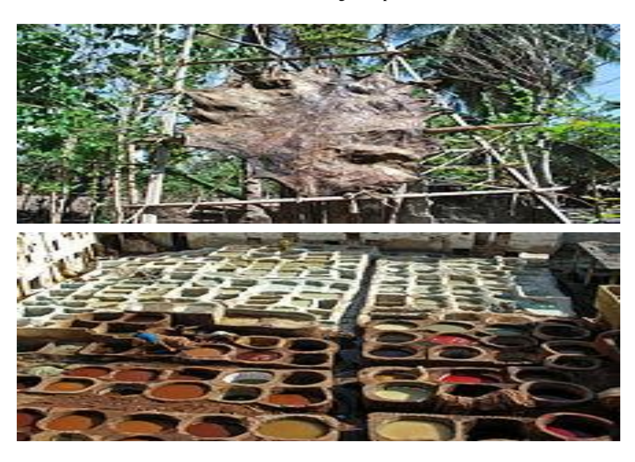
Drying of leather in East Timor Leather tanning

Leather is a natural product. It is a substance which keeps its properties unchanged for many years. It brings prestige to interior with its special feel and aroma. Its extremely strong texture makes it difficult to scratch or scuff. Leather won't stretch out of its shape. It easily adjusts with the environment. As it is preserved in tanning process it is easy to keep it clean and comfortable. It also has a high tensile strength which means that they can sustain high loads at an instance and also they have a long lasting life so they are used in aerospace field where weight is a matter of concern, and also it acts as a permissible membrane with the water vapor which allows the leather to be used in the areas where high temperatures are used.